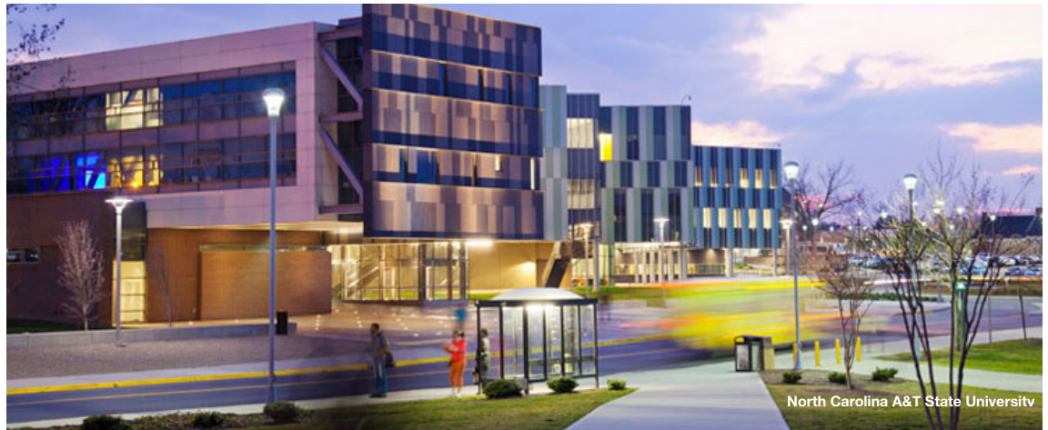
North Carolina A&T State University